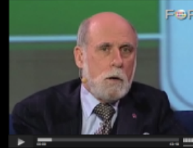
Father of the Internet