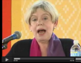
Karen Armstrong on compassion